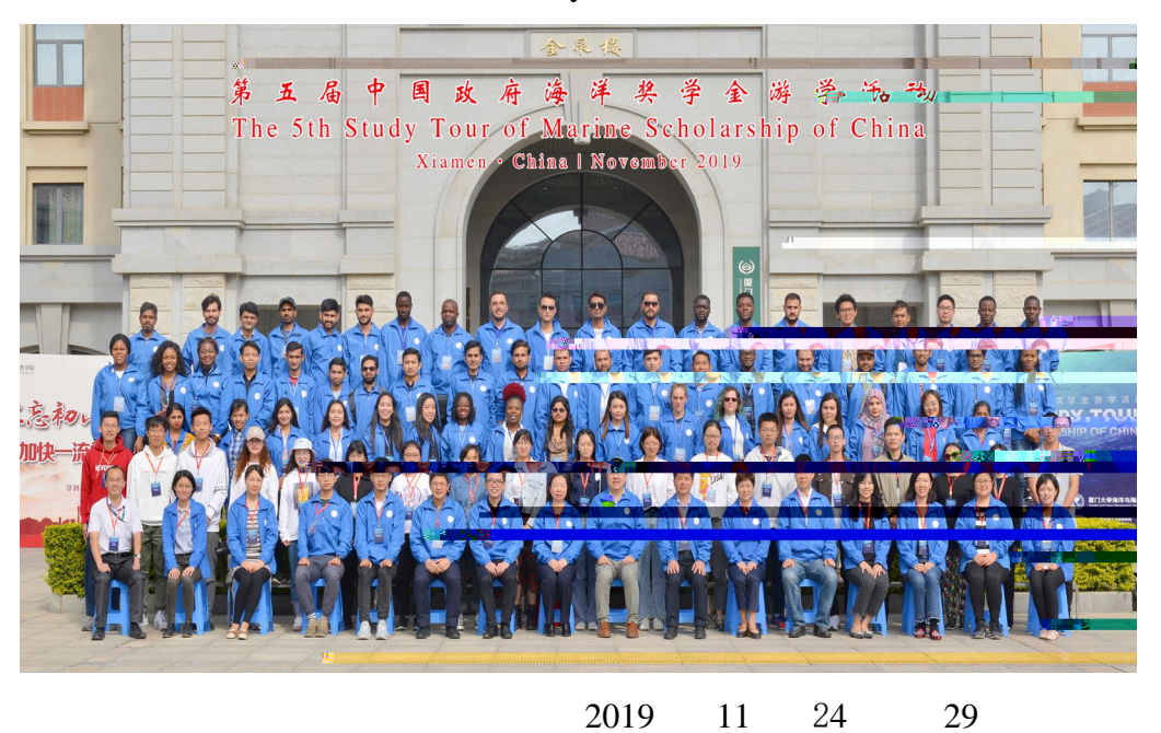
Group photo of 5<sup>th</sup> Marine Scholarship of China exchange program, Nov. 24 to 29, 2019, Xiamen University